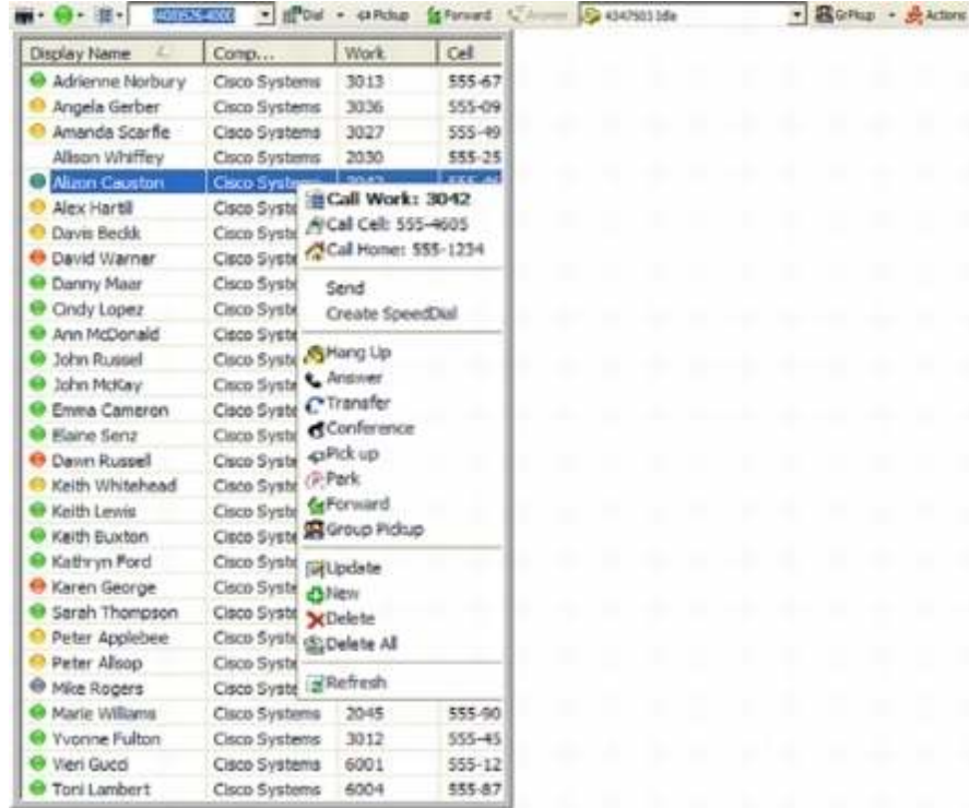
Figure 2. Quick Search Results Window