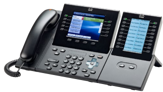
IP Color Key Expansion Module