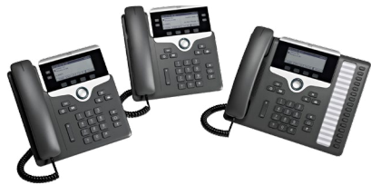
IP Phone 7800 Series

General Business Communications Endpoints