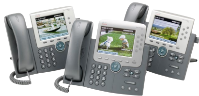
IP Phone 7945G, 7965G and 7975G