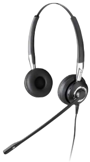
Jabra Biz 2400 Headset

Turn Traditional Telephones into IP Endpoints