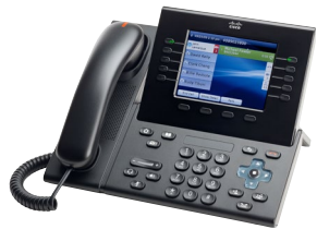
Cisco Unified IP Phone 8961