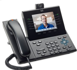
IP Phone 9951