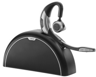
Jabra Motion UC Headset with Travel and Charge Kit

Turn Traditional Telephones into IP Endpoints