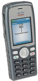
IP Phone 7926G