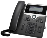
Figure 4. IP Phone 7800 Series

IP Phone 7821 For Light to Moderate Voice Communications