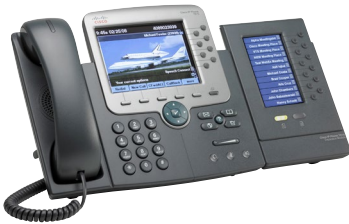
IP Phone Expansion Module 7916