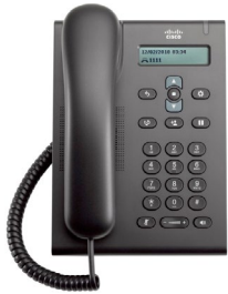
Cisco Unified SIP Phones 3900 Series