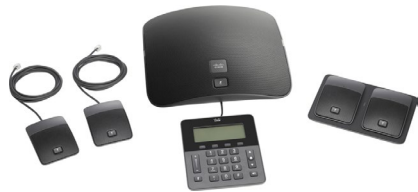
Cisco Unified IP Conference Phone 8831 and Accessories