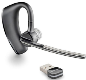
Figure 29. The Voyager Legend UC Is Almost a Personal Assistant

Turn Traditional Telephones into IP Endpoints