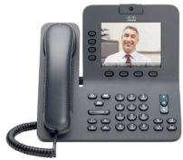
Cisco Unified IP Phone 8945