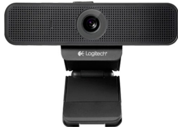
Figure 28. Logitech Webcam C920-C Supports the Cisco DX600 Series as an LCD-Mounted Camera Supporting HD Video Collaboration

Turn Traditional Telephones into IP Endpoints