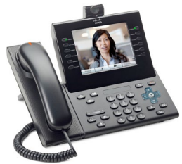
IP Phone 9971