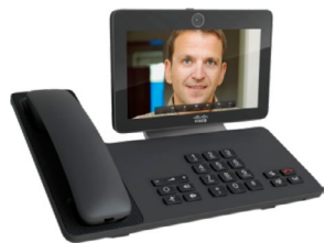
Cisco DX650 Endpoint