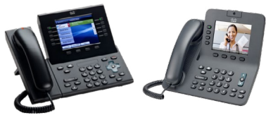
Cisco Unified IP Phones 8900 Series