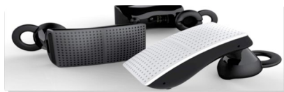
Figure 25. Jawbone ICON for Cisco Bluetooth Headsets

Turn Traditional Telephones into IP Endpoints