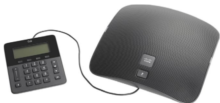
Cisco Unified IP Conference Phone 8831