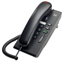
IP Phone 6901

General Business Communications Endpoints