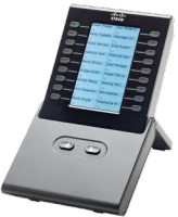
Cisco Unified IP Color Key Expansion Module