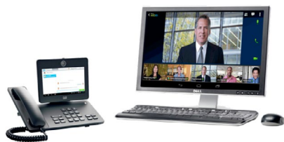
Cisco DX650 IP Endpoint