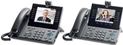
IP Phones 9900 Series