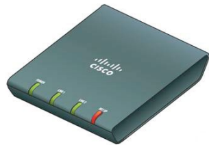
Cisco ATA 187 Analog Terminal Adaptor

Turn Traditional Telephones into IP Endpoints