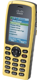
IP Phone 7925G-EX