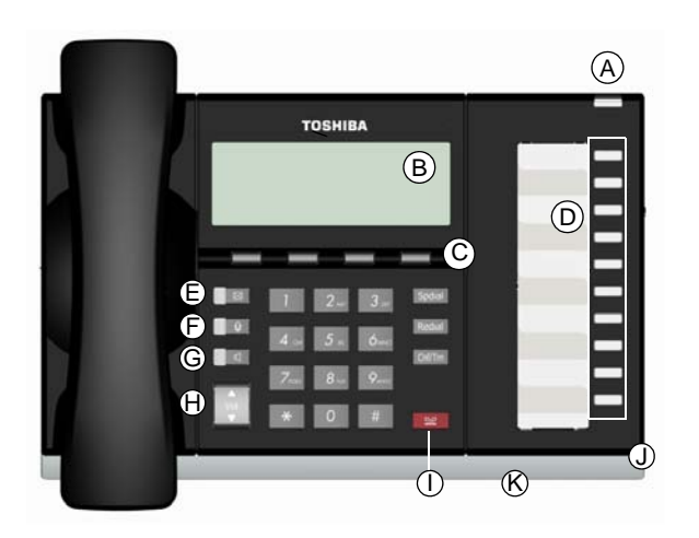
10 Programmable Feature Buttons 4-Line LCD