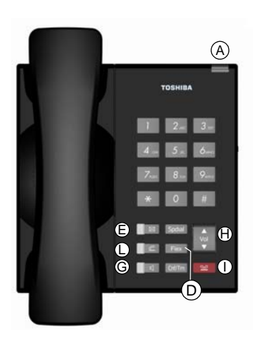
Single Line Telephone 1 Programmable Button