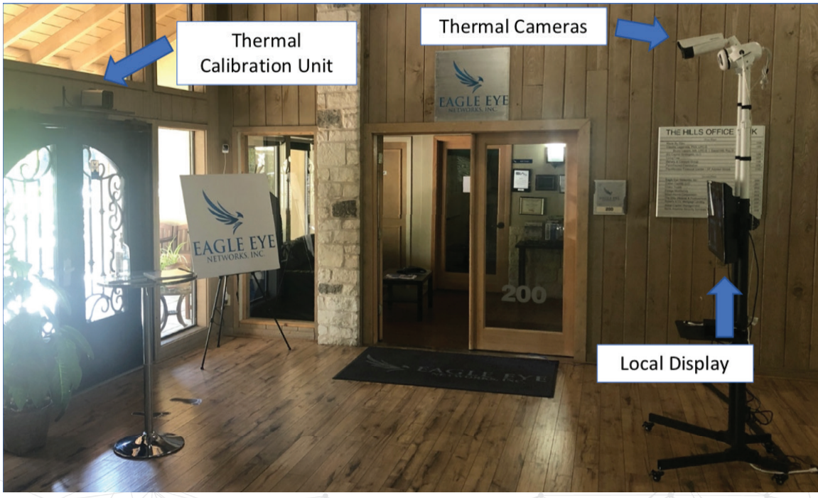
▲ Figure 5: Thermal camera setup in an office lobby