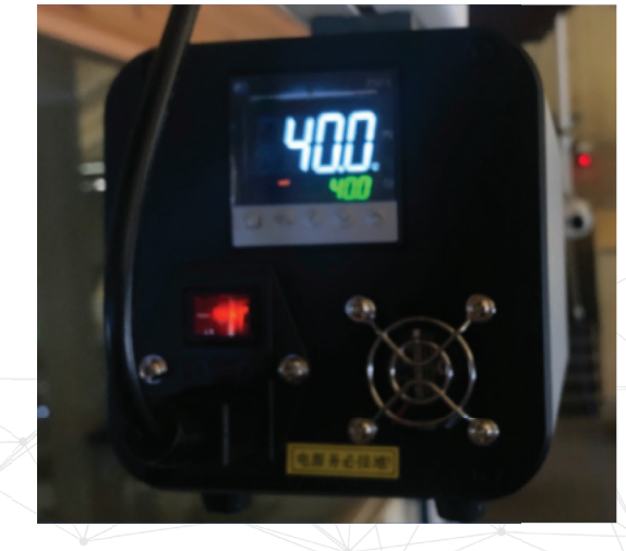
Figure 3: Calibration unit showing the temperature it's emitting (in Celsius)

A thermal calibration unit, sometimes referred to as a blackbody, is a device that maintains a specific temperature and does not reflect any energy from the surroundings. It is used as a constant point of reference for the thermal camera. Not all thermal cameras require a calibration unit, but many can make use of them if they are present. A calibration unit requires electrical power, but is not wired to the camera or the VMS/recorder. It is manually set at a prescribed temperature, and the thermal cameras are configured based on that temperature. Thermal calibration units are typically used when more precise temperature readings are required, such as in Elevated Temperature Screening. Some suppliers include a thermal calibration unit with the sale of the camera, but most do not. Calibration units are generally not present for most cameras connected to a video surveillance system. Many security industry personnel are not familiar with thermal calibration units or their use.